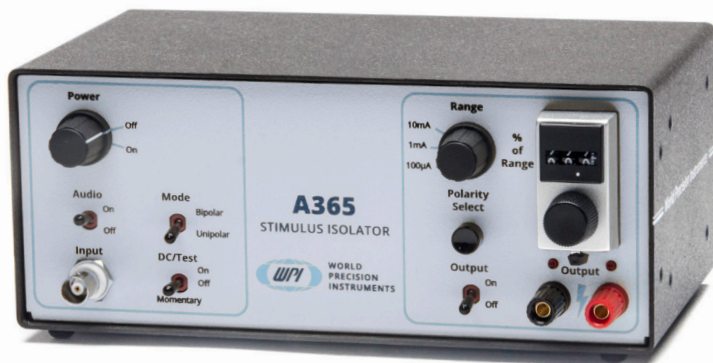
Fig. 1—A365 Stimulus Isolator

NOTES and TIPS contain helpful information.